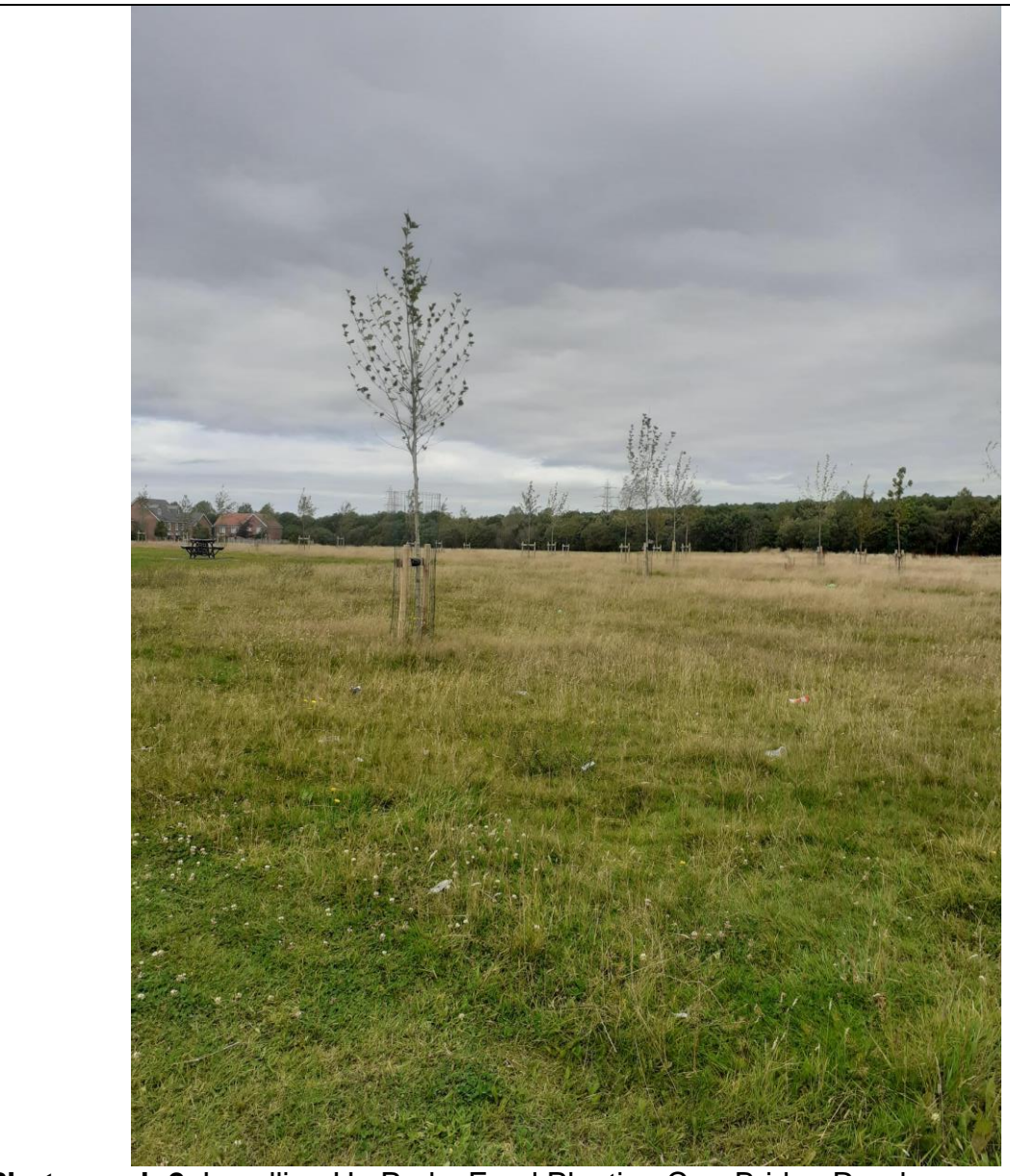
Photograph 2: Levelling Up Parks Fund Planting Carr Bridge Road