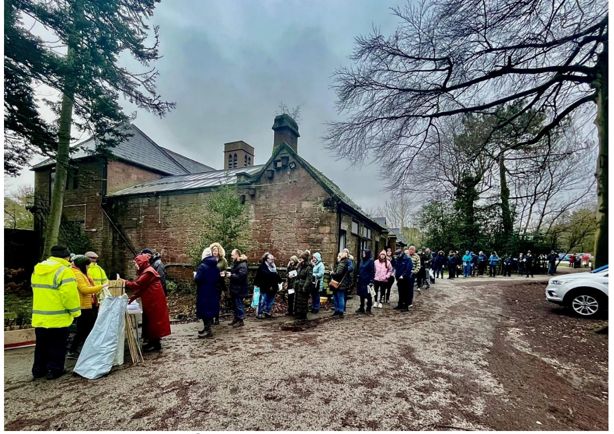
Photograph 4: Free Tree Giveaway Event Royden Park

Photograph 3: Arboretum Arrowe Country Park