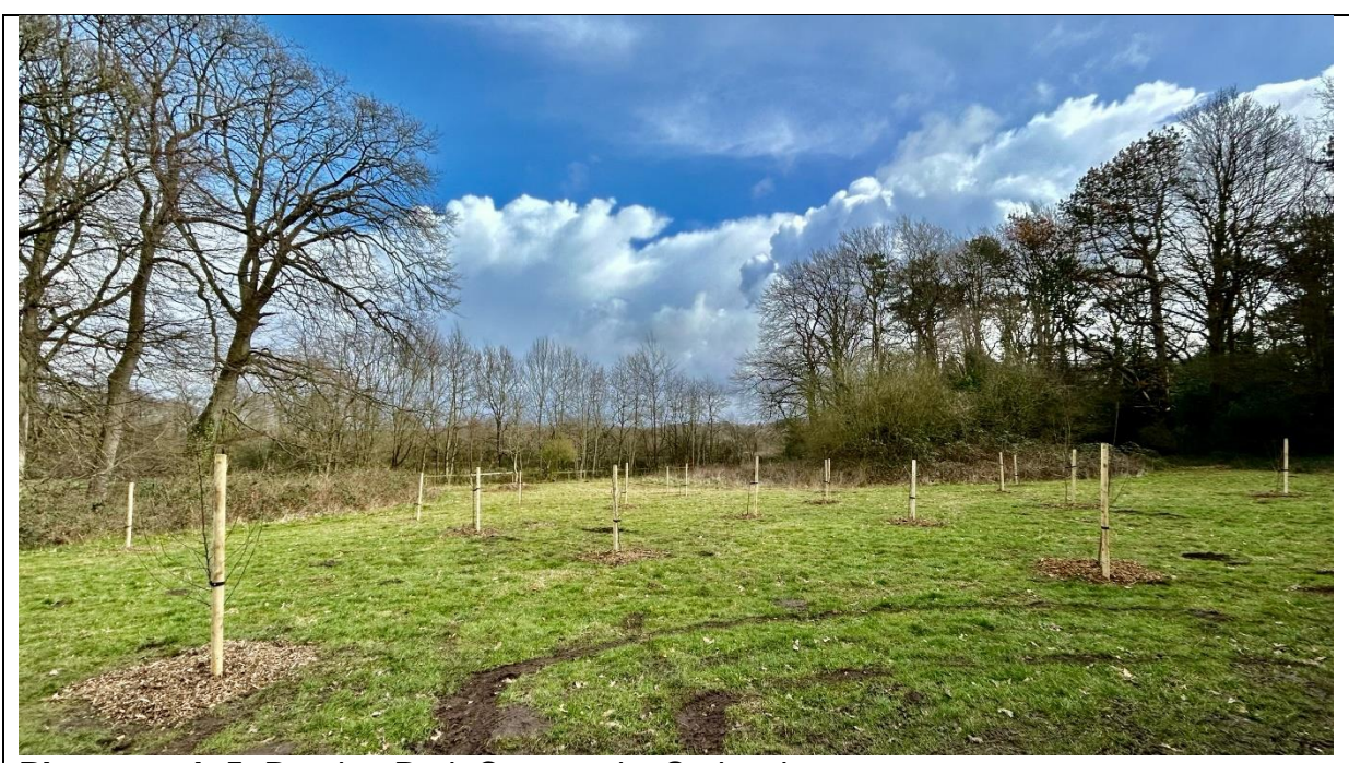
Photograph 5: Royden Park Community Orchard